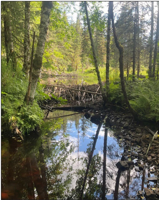
Figure 1. Beaver dam at waypoint 492.