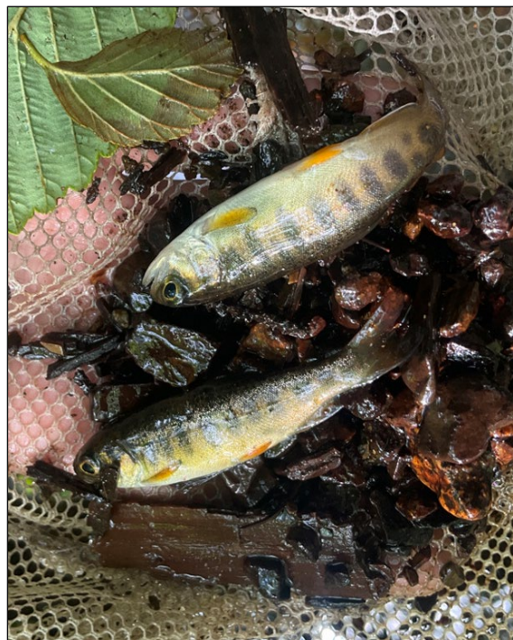
Figure 4. Juvenile coho salmon caught at waypoint 491.