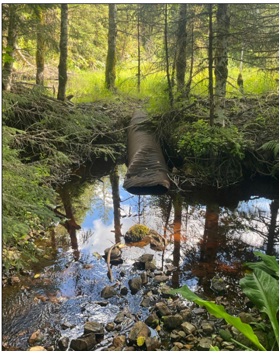
Figure 3. Damaged pipe at waypoint 492.