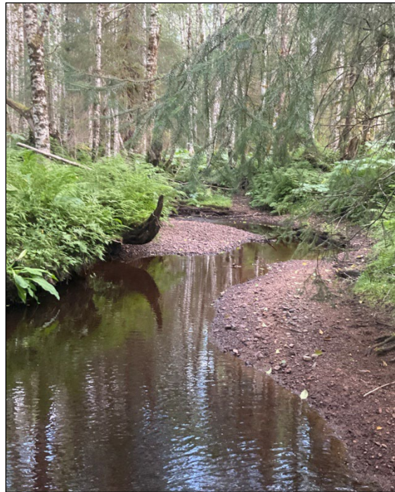
Figure 2. Downstream at waypoint 490.